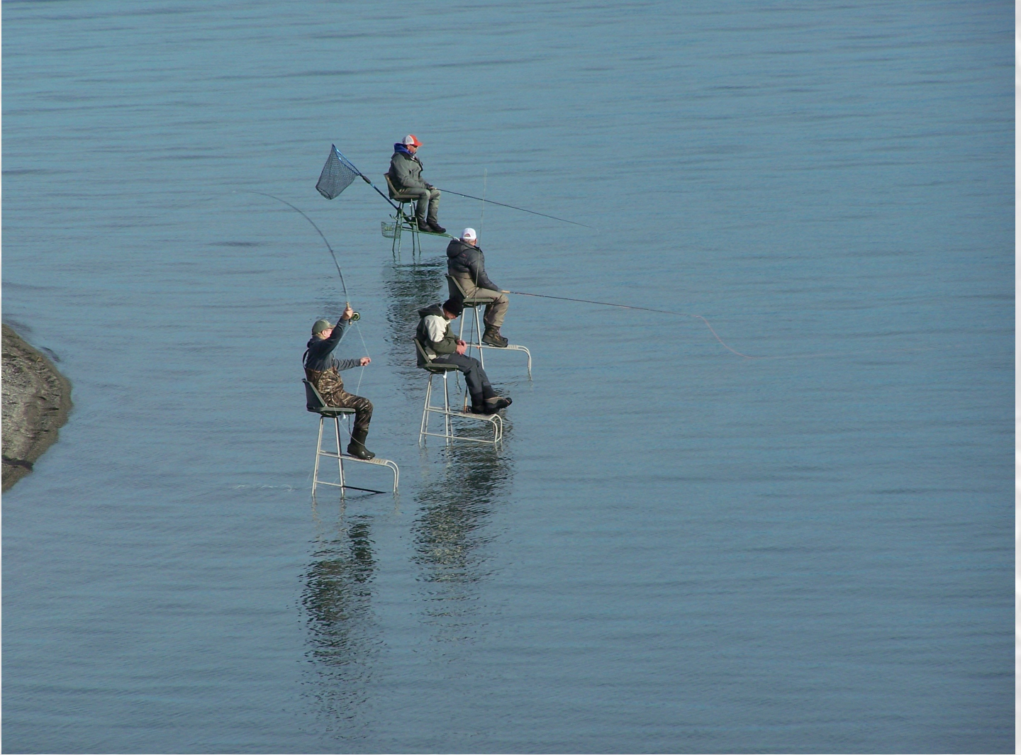
Ladder Chair fishermen - photo by Dan Mosley

Pyramid Lake Fishermen today are known for fishing on ladders, or from a custom built 'ladder chair' on a frame welded from galvanized metal. This practice started many years ago, using milk crates to allow fishermen to fish further out into the deeper waters of the lake. Back in the day, fishermen began standing on objects like used milk crates, in their attempt to get higher out of the water, above the waves, and to stay a little bit warmer. Duck decoys were often used as floatation devices to mark the location of the milk crates.