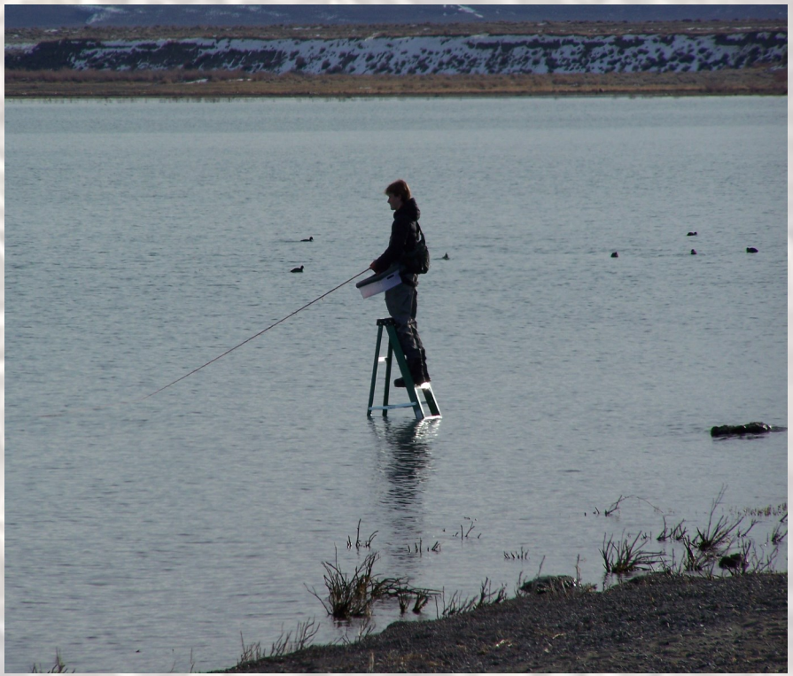
Ladder fishermen